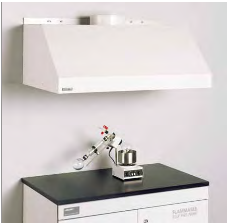
Canopy Hood 4799000. Blower and ductwork must be ordered separately.

The Canopy Hood is specifically designed to vent non-toxic materials such as heat, steam and odors from large or bulky apparatus such as ovens, steam baths and autoclaves. The hood may be installed on a wall or suspended from the ceiling for peninsular and corner locations. For most efficient performance, the hood should be installed no more than 12" above the equipment to be ventilated. Coupled with a blower and ductwork, the Canopy Hood can operate at a wide range of exhaust rates.